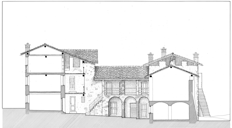
Detached courtyard house in Novazzano (Ticino), 1. est facade 2. nord facade 3. and 4. sections, 1:100