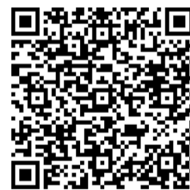
Spring Course (FS23) by CEA

The Spring Course of D-BAUG and the Focus Work of D-ARCH plan the reuse of the Huber Pavilions' components on the Höggerberg Campus in a design and construction next to HIL. It is organized as a joint venture by the Chair of Circular Engineering for Architecture from D-BAUG and the Chair of Architectural Behaviorology from D-ARCH and open to students from all departments. (max. 25 places)